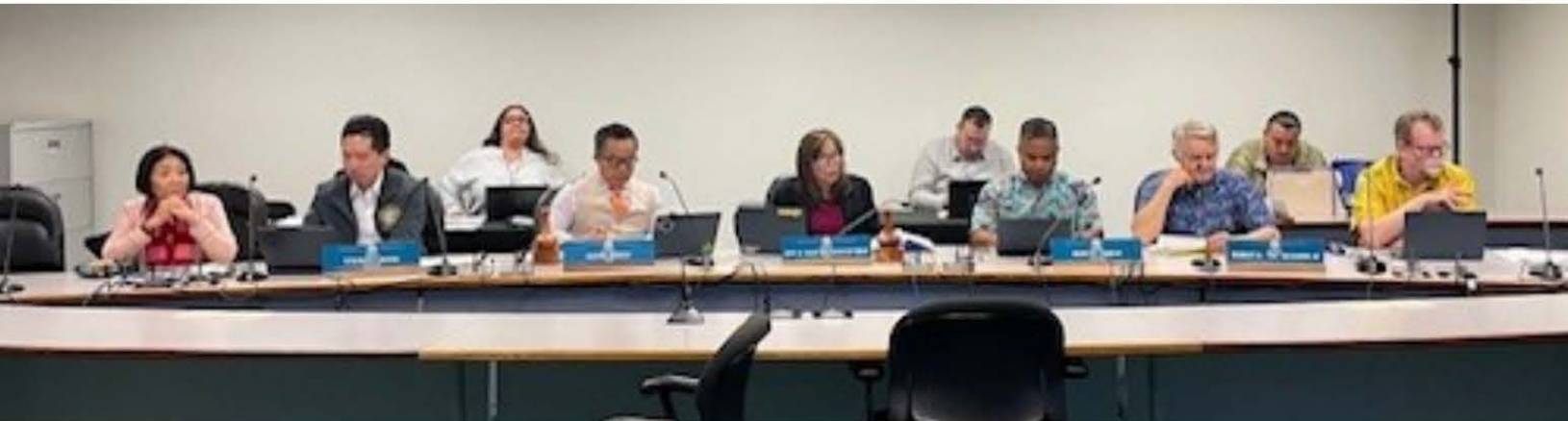
Holding a joint Health & Human Services and Energy & Intergovernmental Affairs committee. On this day both committees voted to pass Senate Concurrent Resolution 58 (SCR58), urging the counties to install and maintain a set of accessible recreational playground equipment in county parks. This measure would help to support physical health of youth with disabilities, while also encouraging inclusion and integration in the community.