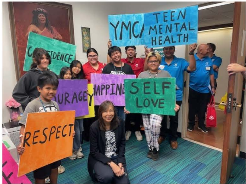
With young advocates for the Hawaii YMCA.