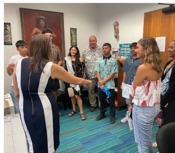
Meeting with student advocates for access to school meals. Since our meeting the legislature passed Senate Bill 1300 (SB1300). SB1300 appropriates funding to expand access to free school meals and provide support for families classified as ALICE – Asset-Limited, Income-Constrained, Employed – working families who may not qualify for existing assistance programs but still struggle to meet their children’s basic needs. These programs ensure that students have the nourishment to focus on their studies and create an environment where all students can attend school without feeling self-aware or anxious about their household incomes.