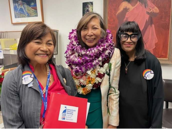
With the American Cancer Society Cancer Action Network.