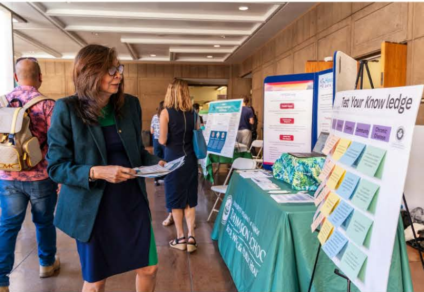
Looking at one of the many displays at this year's "Ag Day at the Capitol." Agriculture has been vital to Puna's economy and culture.