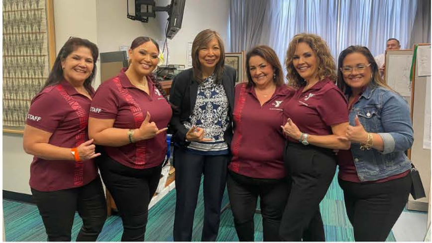
With the Hawaii Island YMCA team. The YMCA offers programs and services that support people of all ages, backgrounds, and walks of life. I'm so grateful for all that they do for our community.