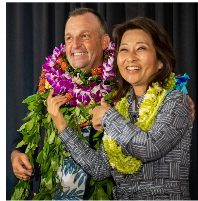
Hawaii voters have elected Josh Green as governor, and Sylvia Luke as Lieutenant governor (above).

The new Governor and Lt. Governor will be sworn in on December 5, 2022. Specific information regarding the inauguration event will be posted to our social media as details are released.