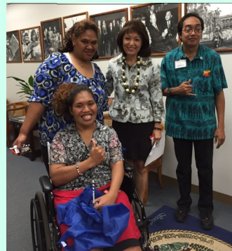
Best Buddies Aiea High School Chapter expressed their support for anti-bullying bills to include developmentally disabled students.