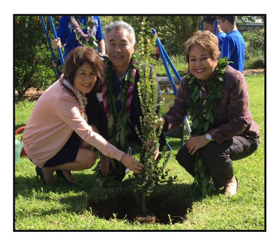
Planting a native tree with Governor Ige and his wife at the Waimea Middle School STEAM building dedication.