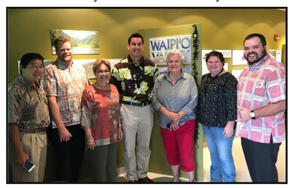
North Hawaii Education and Research Center (NHERC) Visit