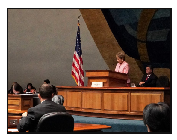
Senator Inouye's Moment of Contemplation August 31, 2017

Senator Lorraine Inouye Hawaii State Capitol 415 So. Beretania St., Room 210 Honolulu, HI 96813