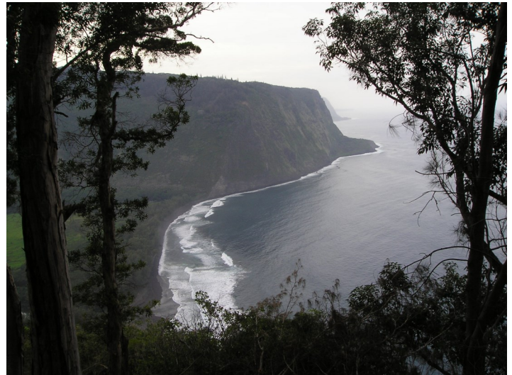
View from Waipio Valley lookout.

The first has to do with the Kohala Ditch. While the ditch itself carries water for over 20 miles, it runs through many privately owned parcels and serves over 90 businesses and residences. This CIP request is for a study to assess the feasibility of the state maintaining and improving the ditch to provide adequate and reliable water to the community.