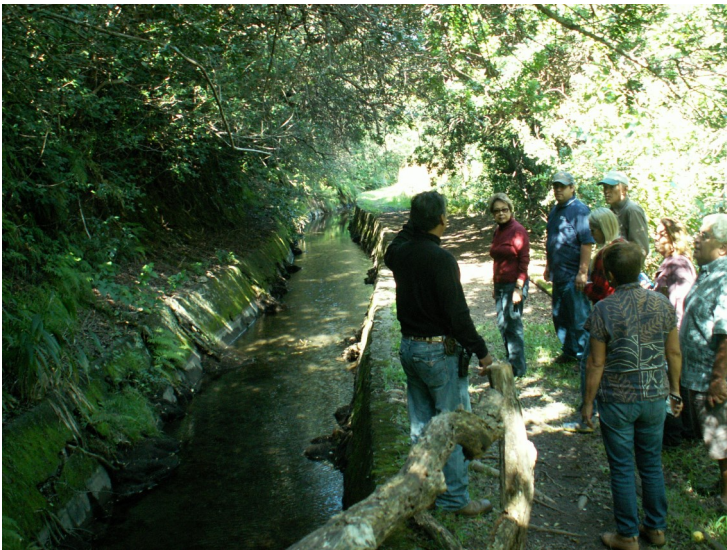
Senator Inouye visits the Kohala Ditch with constituents on December 29, 2014—six days after the storm that left the community with severe flood damage.

The second CIP request is for Waipio Valley and in particular, Ha Ola o Waipio, a new group formed within the Waipio community to continue the implementation of the 2006 NCRS Waipio Valley Stream Management Plan. The funding would provide equipment and construction costs to the group to provide preventative flood control measures and stream bank stabilization.