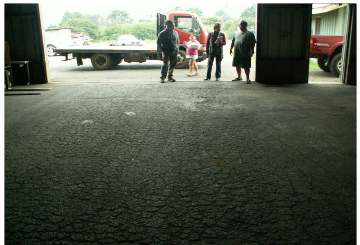
Senator Inouye visits the Kamuela Vacuum Cooling Plant in late December 2014.

The third request is for the Kamuela Vacuum Cooling Plant. The project will include planning, design and construction for improvements to the aging infrastructure of the building. Also included is the installation of up to a 100KW photovoltaic system that will help offset the costs of running the cooling plant and decrease costs for users in the community.