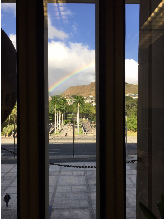
The view from Senator Inouye's office. The eternal flame, framed by palm trees, below Punchbowl and blessed by a rainbow.