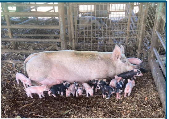
I was amazed at the contented look on this mom's face at 'Aina Ho'okupu O Kīlauea on Kaua'i, Sept. 3.

most consistent growers of highquality organic produce and exotic tropical fruit on the Garden Isle. Next stop was Kilauea Community Agricultural Center, 'Aina Ho 'okupu O