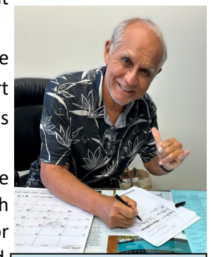
Sen. Gabbard signs the final Committee Report

GroupGAP Food Safety Training (SB1588) Did you know close to 50 million people in the U.S. get sick and 3,000 die each year from foodborne diseases according to the Center for Disease Control and Prevention? In 2011, the federal Food and Drug Administration (FDA) created FSMA (Food Safety Modernization Act) to help prevent this. Then, in 2015, the US Dept of for Session 2023!