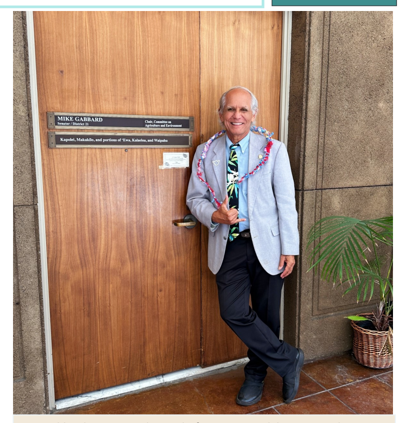
Sen. Gabbard wearing a lei made from marine debris on April 4, Ocean Awareness Day at the Capitol.

Presented by the Hawai'i State Foundation on Culture and the Arts