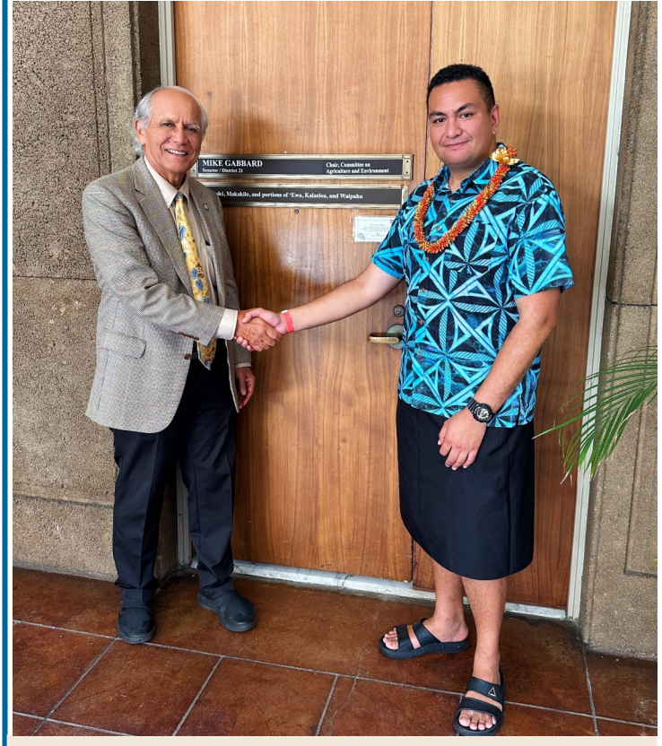
Sen. Gabbard met with Fale Andrew Lesā JP, city councilor for Auckland, New Zealand, on March 15, 2023.

The Waimanalo Agriculture Association (WAA) held their bi-monthly meeting on March 9 at the Plant Place in Waimanalo. Before discussing legislative priorities, WAA hosted a very informative <u>Coconut Rhinoceros Beetle</u> Demonstration project with University of Hawai'i CRB representatives, Mike Melzer and Keith Weiser. They shared info on preventing CRB infestation, and some best practices for mitigating the spread of the destructive beetles. The CRB can grow up to 2.5 inches long and they're spreading across our island at a faster rate than farmers can tackle. If you see this beetle anywhere in Hawai'i- call 643-PEST or report it <u>online</u>! If you'd like to contact the Coconut Rhinoceros Beetle Response Plan, you can do so at info@crbhawaii.org.