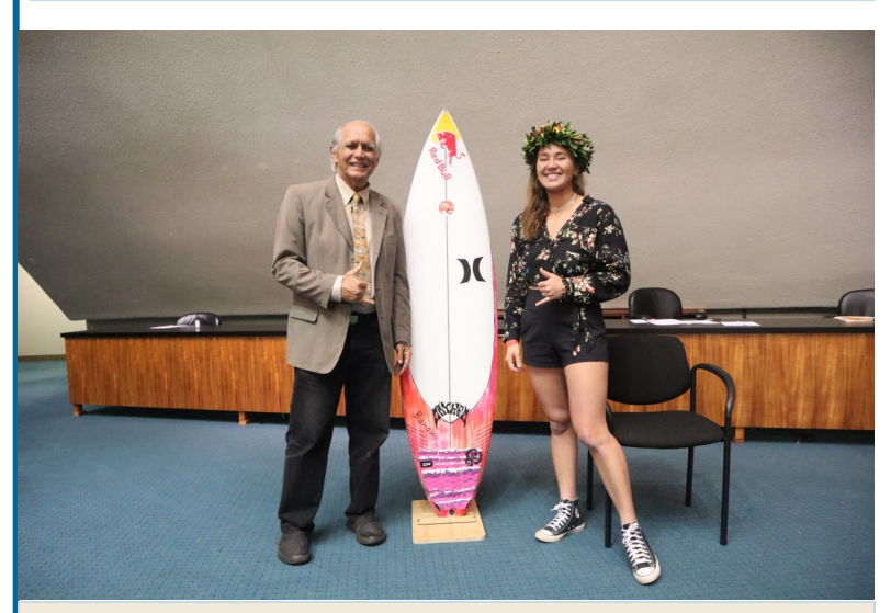
Sen. Gabbard met Olympian gold medalist and world-class surfer Carissa Moore, who was honored during the Hawai'i Senate's floor session on March 20, 2023.

A big AlohaCongrats to Carissa Moore, who was honored on March 20, 2023 by the Hawai'i State Senate <u>during floor</u> <u>session</u>! Carissa is not only the first-ever female gold medalist in Olympic surfing history, but also the world's first Olympic gold medalist in surfing. Carissa shares the spirit of Aloha wherever she goes and is a strong advocate for charity. You can find info on her non-profit "Moore Aloha" here.