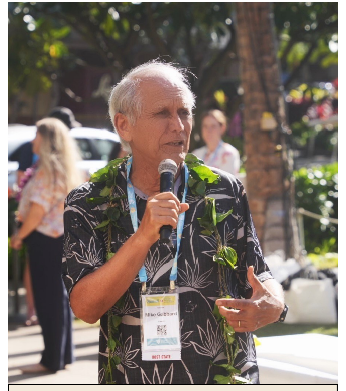
Senator Gabbard attended the Council of State Governments (CSG) Conference from Dec 7-11.

A very important session was in anticipation of the next Farm Bill in September 2023, where a panel of state agriculture officials and experts in the industry discussed what to expect (cont. on P3)