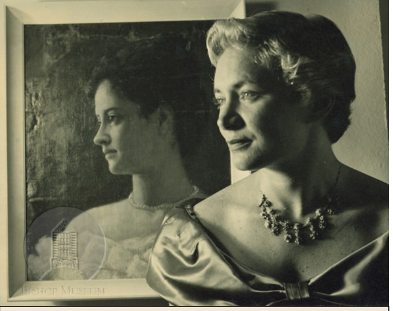
Photo by Joe Pacheco, Bishop Museum, of Princess Abigail Kinoiki Kekaulike Kawānanakoa.