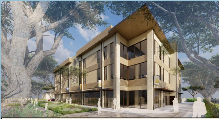
A rendering of DreamHouse Center, a mixed-use building being developed in Kapolei Pacific Center. It will be anchored by the Ewa Beach charter school.