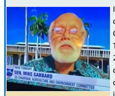
Sen. Gabbard attended a Zoom meeting of the Fuel Tank Advisory Committee on Oct. 30, 2020.

I attended a virtual meeting of the Fuel Tank Advisory Committee on October 30. The Committee was set up in 2016 by Act 244, which mandates a permanent, "advisory committee that shall study issues related to leaks of field -constructed underground fuel storage tanks at the Red 🔸 Hill Fuel Storage Facility, Kuahua Peninsula, Pacific