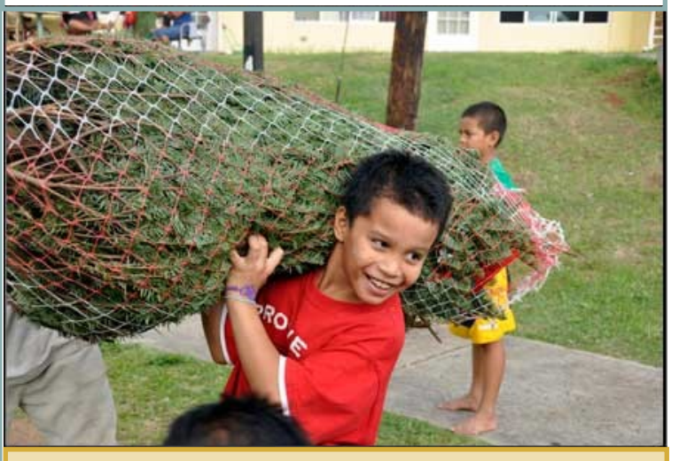
Habilitat is holding a Christmas tree fundraiser at the old Kapolei Kmart parking lot.

As of November 30, Habilitat is holding a Christmas tree fundraiser at the old Kapolei Kmart parking lot (500 Kamokila Blvd). The trees can be picked up from noon to 9pm each day until they are sold out. The available trees will be fragrant Douglas firs (4-10 feet), dark green noble firs (2-9 feet), soft and silvery grand firs (2-10 feet), and bright green Nordmann firs (6-10 feet). The proceeds will help Habilitat's participants that are struggling with substance abuse and homelessness. For more information, go to <a href="https://www.habilitat.com/hawaii-christmas-trees/">https://www.habilitat.com/hawaii-christmas-trees/</a>