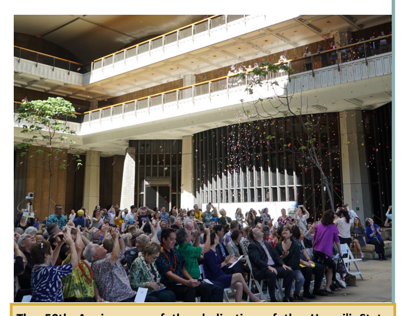
The 50th Anniversary of the dedication of the Hawai'i State Capitol on March 15, 1969, was celebrated with music, dancers, speakers, and the unveiling of a time capsule. To add to the magical feeling, hundreds of rose petals fluttered down onto the rotunda, released from school children above.

Art at the Capitol has grown to be a much-anticipated spring tradition. Throughout the evening, music is performed by the Hawai'i Youth Symphony. The program ends at 7 p.m., and the public is invited to continue the celebration of local art and music just across the street at the Hawai'i State Art Museum, which will be open until 9 p.m. Hope to see you then!