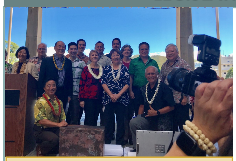
On March 15, Sen. Gabbard attended the celebration of the 50th Anniversary of the dedication of the Hawai'i State Capitol.