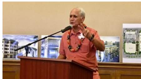
Sen. Gabbard was invited to speak in honor of the groundbreaking of the "Aloha Pacific Center," on Jan. 13.

I was invited to speak at the Filcom Center Ballroom recently in Waipahu, in honor of the groundbreaking of the "Aloha Pacific Center," an exciting project to begin in 2017 in Kapolei.