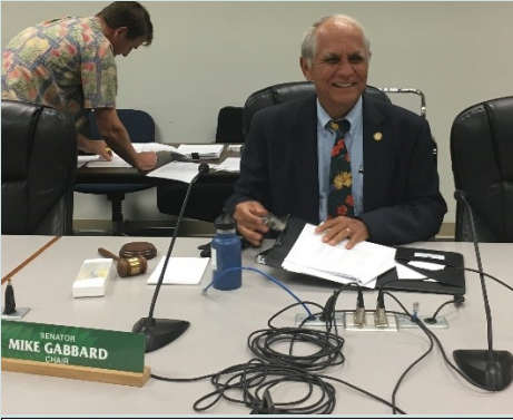
Sen. Gabbard held the first hearing for the Agriculture and Environment committee of the 29 th Legislature Jan. 30. Nine of 10 bills passed, including SB 778 and SB 779, related to pesticide use in Hawai'i.