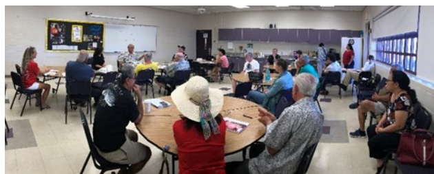
Senator Gabbard held his Listen Story community meeting on Jan. 28 at the Kapolei High School Teachers' Lounge. Thanks to everyone who came out!