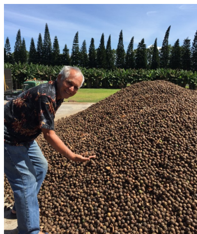
Sen. Gabbard toured Ka'u Coffee Farm in Pāhala on Nov. 25.