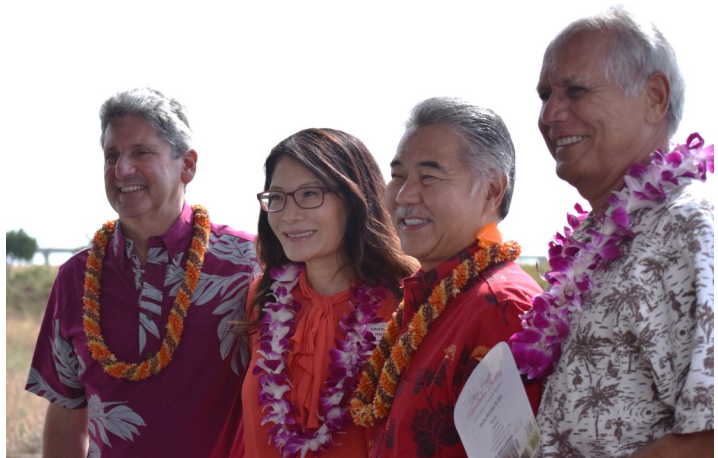
UH President Lassner, Rep. Har, Gov. Ige, and Sen. Gabbard

health information management, and occupational therapy. Students will also take classes to complete public administration degrees with concentrations in justice, healthcare, and disaster preparedness and emergency management in the new building. The state appropriated $36.7 million for the project and the building is scheduled to open in fall 2018.