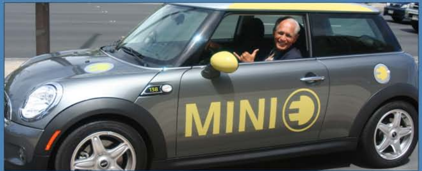
Senator Gabbard took BMW's demo "Mini-E" electric vehicle for a test-drive on April 13th - up to 70 miles on one charge!

www.capitol.hawaii.gov/session2010/lists/RptMeasuresPassed.aspx