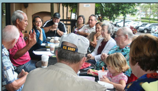
Sen. Gabbard's Kapolei "Listen Story" Meeting January 9, 2010