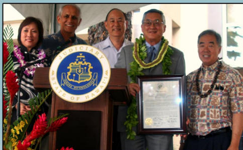
Blessing of the Kapolei Judiciary Complex May 28, 2010