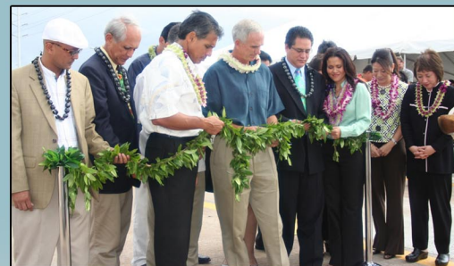
Dedication of Kualaka'i Parkway February 11, 2010