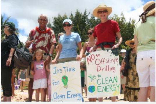
Hands Across the Sand at Waikiki June 26, 2010