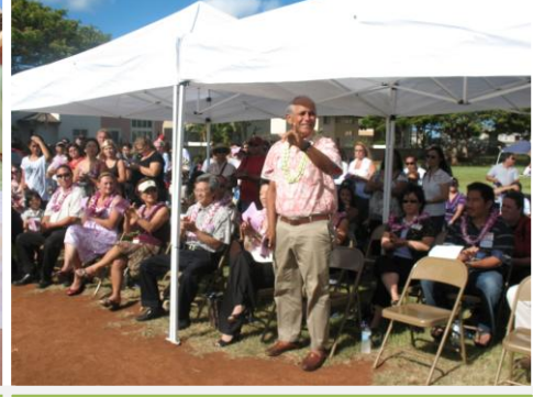
SongFest at Kapolei Elementary June 10, 2010