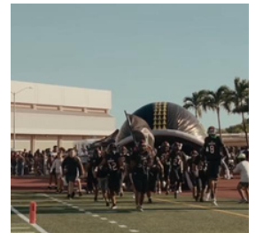
Our Sabers hyped up before the game. Let's go Sabers!

The James Campbell High School held its annual Saber homecoming game and fair last month. The immense support from our community for our keiki was amazing. The fair was filled with performances by our Sabers that participated in several of the extracurricular activities. Late that evening, Sabers competed against Farrington High School's