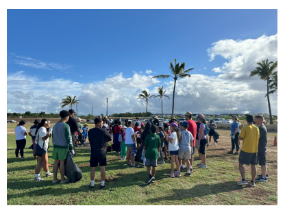
Volunteers of all ages, participated in the community cleanup and the global movement.

Every third Saturday of September is known as, "World Cleanup Day." My staff and I volunteered at a cleanup Haseko organized at the One'ula Beach Park. Many volunteers joined in the mission to tackle the issues of littering and mobilizing our resources for improving the appearance and beautifying our public facilities. Mahalo to Haseko and all the volunteers for your time and efforts!