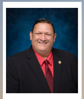
Senate District 20: 'Ewa Beach, Ocean Pointe, 'Ewa by Gentry, Iroquois Point, and portion of 'Ewa Villages