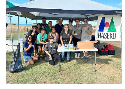
The team that helped organized the event-Haseko Hawai'i.

Every third Saturday of September is known as, "World Cleanup Day." My staff and I volunteered at a cleanup Haseko organized at the One'ula Beach Park. Many volunteers joined in the mission to tackle the issues of littering and mobilizing our resources for improving the appearance and beautifying our public facilities. Mahalo to Haseko and all the volunteers for your time and efforts!