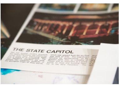
The State Capitol opened on March 15, 1969.