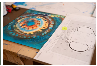
The art piece (left) will be located on the Hotel Street side of the State Capitol.