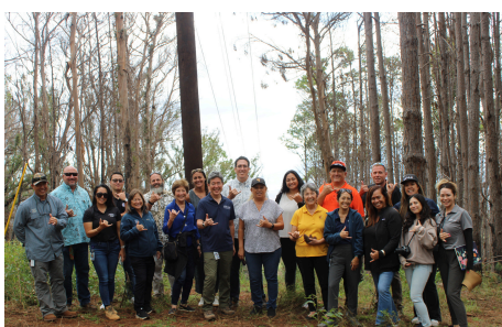
Visiting an Upcountry site that serves a remote area.

The Senate committees on Energy, Economic Development, and Tourism (EET), Commerce and Consumer Protection (CPN), and Ways and Means (WAM) attended a site visit on Maui. The Hawaiian Electric company (HECO) provided a tour for the legislators around its infrastructure and operations. The purpose of the visit was to provide the committees