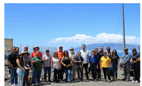
One of HECO’s sites in the West Maui community.

an update on how the system operators manage and oversee Lana’i, Moloka’i, and Maui. The tour included a stop near Maui Ocean Center, Lahaina Substation 34, underground infrastructure near Front Street area, and multiple visits Upcountry. The committees also had the opportunity to see the newest fire detection tools.