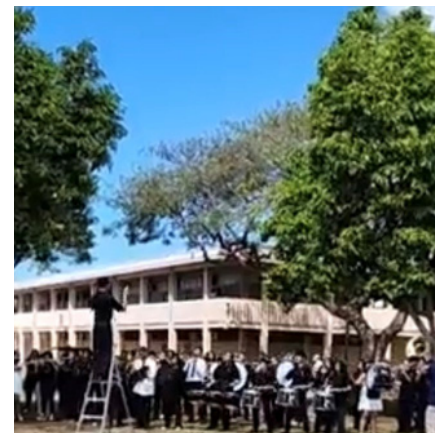
The Sabers Marching Band performed on May 18, 2023, to show their appreciation to the sponsors of a check they received to help finance its Washington D.C. trip.