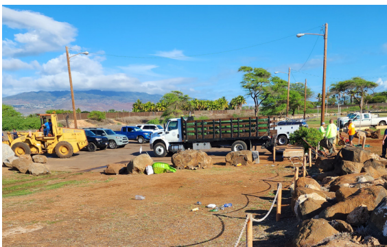
On November 2, 2022, HPD and members from the City's departments were collecting trash and cleaning the nearby area.

On Tuesday evening, November 1, 2022, the Weed & Seed Hawaii, God Forgives Bad Boys and Bad Girls, and HPD organized a Neighborhood Security Watch on Pohakupuna Road. There were well over 60 individuals joining in on this walk. Members from the District 8 Community Policing team, residents of the surrounding area, and Ewa Beach community members gathered to show their support in keeping Ewa Beach safe. You may find more community events similar to this on HPD's website, https://www.honolulu.org/community-calendar/ .