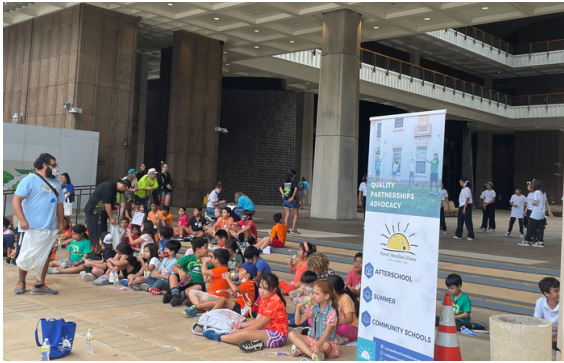
On October 19, 2022, schools from all over O'ahu came together to celebrate and support the need of having afterschool programs.

On Hawai'i Afterschool Alliance and afterschool programs joined in a nationwide series of celebrating and supporting afterschool programs. The importance of having these afterschool programs is essential as it helps our keiki develop academically and socially. The quality time used is not just for the benefit of our keiki, but also our parents, and communities.