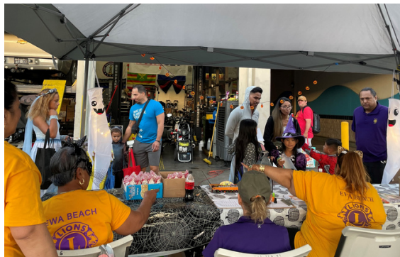
Members of the Ewa Beach Lion Club and HPD (not pictured) were passing out bags of treats to the keiki.

For more information, please visit: https://www.hawaiiafterschoolalliance.org/