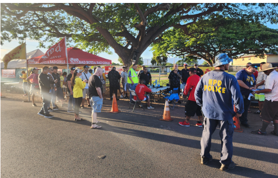
'Ewa Beach residents gathered around to begin their security watch.

As an announcement, the EBLC will be hosting its Community Christmas Parade on Saturday, December 17, 2022 at 10 o'clock a.m. For more information and to apply to participate in the parade, please visit: https://www.eblcf.org/ .