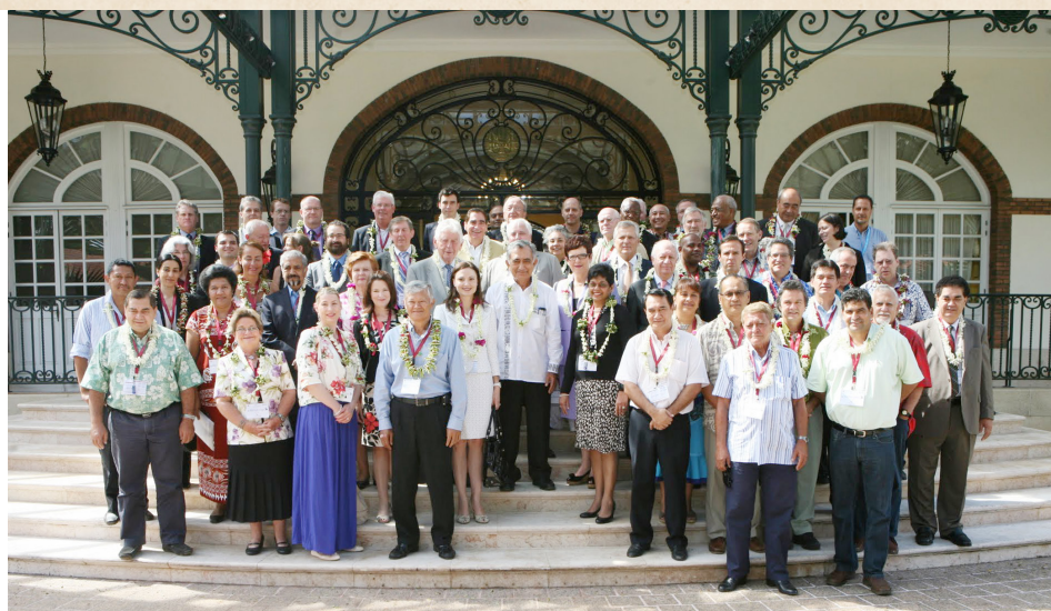
Ten former Heads of State, regional experts and world organizations gather at the Presidential Palace to examine economic resiliency in the Pacific. Pape'ete, Tahiti. July 5, 2012.

Senator J. Kalani English attended the Club de Madrid Asia Pacific Forum, "Building a More Resilient Pacific in the 21st Century World Order," on July 5th and 6th, 2012 in Pape'ete, Tahiti. Hosted by the Club de Madrid and the Government of French Polynesia, the forum was aimed at identifying and discussing strategies to promote greater socio-economic development in the Pacific and render the region more resilient, connected to the world, and capable of effectively delivering services to its citizens.