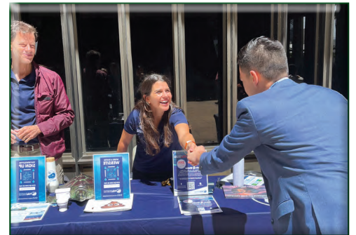
We celebrated Ocean Awareness and Action Day at the Capitol and I was able to speak with various community groups, government agencies, students, and other advocates about ocean conservation and protection. Included were an impressive number of displays and active organizations joining together to address implications of keeping our oceans healthy. Now more than ever we must take action to protect our oceans, communities, and environments from the adverse effects of climate change and pollution.