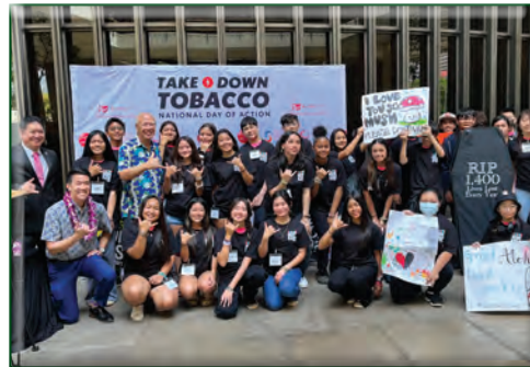
I was honored to speak at a rally supporting the amazing efforts of the students, faculty, and parents who came to make their voices known, and to rally in support at the Take Down Tobacco Day at the Hawai'i State Capitol.