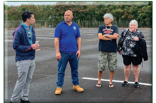
An on-site meeting with 'Aiea residents regarding the growing homeless issues on City properties and surrounding areas of the Newtown Neighborhood Park comfort station as well as an update on the City signage and comfort station locks.