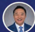
SENATOR GLENN WAKAI