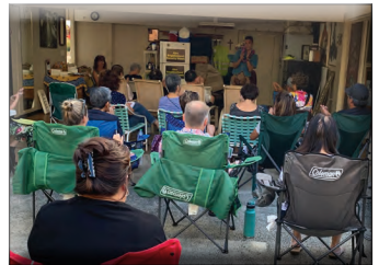
Senator Elefante speaks with members of the the 'Aiea Neighborhood Security Watch.