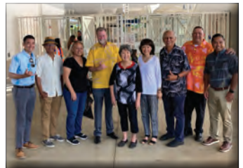
Senator Elefante attended the opening of the Skyline at the Hālawā Station along with Legislative colleagues and staff.