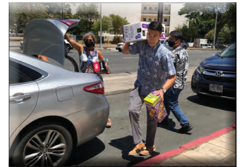
Sen. Elefante participated in the State Capitol's drive for Maui wildfire victims.

Every single spot of available space in the Hawai'i State Capitol from the House and Senate Chambers including the chamber level halls, and conference rooms were packed full with donations from legislators and their staffs. Special thanks to all offices for responding so quickly to this call to action and to all who participated at all levels with the donations, packing, and logistics involved. It was truly a Herclean effort that will make a difference in the lives of so many.