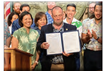
Gov. Green signed key transportation/safety legislation, including Senator Elefante's SB497 that prohibits oversized vehicles from driving slow in the left lane/high occupancy vehicle lanes.