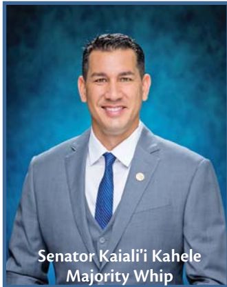
Senator Kaiali'i Kahele Majority Whip

As a Native Hawaiian growing up in Hawai'i, protecting our environment and natural resources have always been a top priority of mine. I believe if we invest in policies that balance environmental sustainability with economic stability, we can unlock the potential of a green-economy for future generations while creating new jobs that have been lost to globalization. Hawai'i is already experiencing the devastating effects of climate change as coastal erosion and sea level rise occur. These issues cannot wait any longer and must be addressed today.