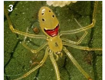
The mission of DLNR's Division of Forestry and Wildlife is to responsibly manage and protect watersheds, native ecosystems and cultural resources.