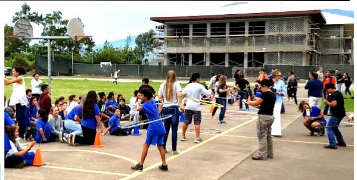
Waimea Middle School's still-under-construction $16 million, nine-classroom STEAM Building will be the largest structure in Waimea.

As Chair of the Senate Committee on Education, I was invited to accompany Hawaii Island lawmakers on a tour of public schools in Kohala and Waimea. At right, the STEAM (Science, Technology, Engineering, Arts and Math) building at Waimea Middle School will open for the new school year. I worked with my colleagues in the 2013-2014 sessions to obtain $16 million in funding for this major new facility. The building includes a large interior corridor and three smaller rooms that can be used as alternative project work spaces for students.