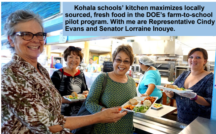
Kohala schools' kitchen maximizes locally sourced, fresh food in the DOE's farm-to-school pilot program. With me are Representative Cindy Evans and Senator Lorraine Inouye.

A pilot program was underway this year in Kohala schools to develop guides for Farm-to-School activities, including purchasing locally grown food and ingredients, modifying school lunch menus, kitchen staff training on scratch-cooking, minimizing food waste, and growing food for cafeteria use. The program will expand to all Hawaii Island schools, then to Maui, and eventually to Oahu campuses.