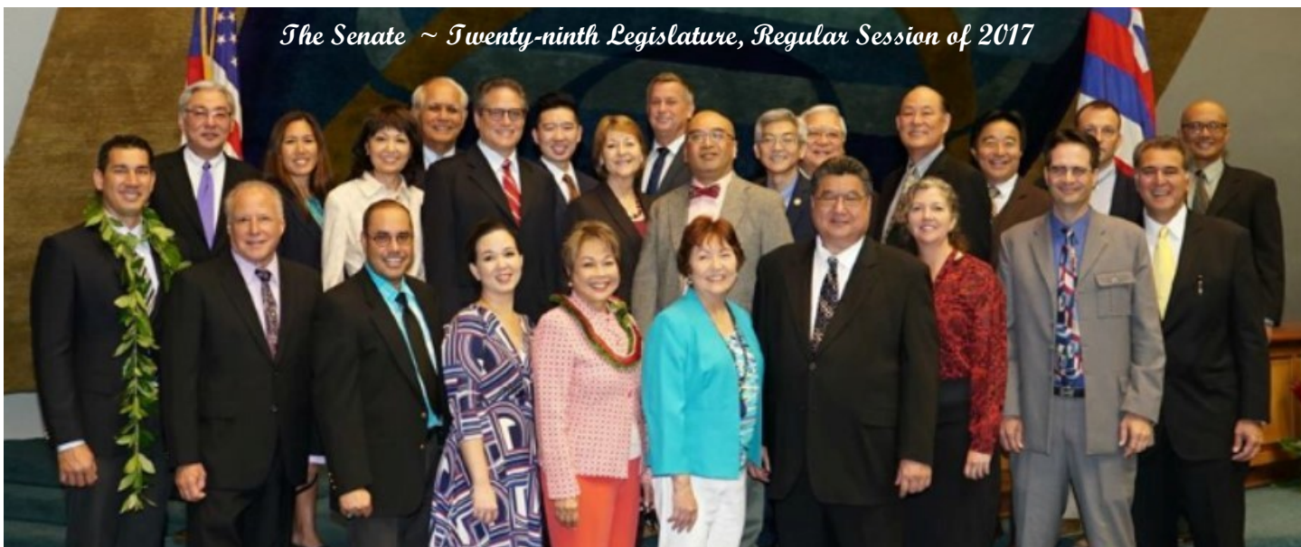
The Senate ~ Twenty-ninth Legislature, Regular Session of 2017

Watch for a special edition of our legislative newsletter to be mailed to all households next month with detailed listings of bills we passed and issues we addressed.