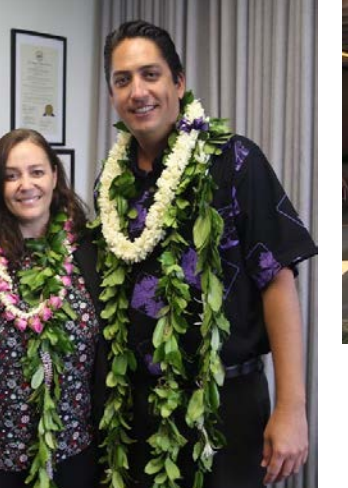
of the 2020 Legislative Session.