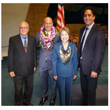
Big Island Senators celebrating with Judge Jeffrey A. Hawk after his confirmation during the First Special Session of 2019.