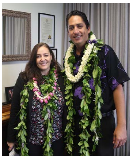
Sen. Kanuha and Rep. Lowen on Opening Day