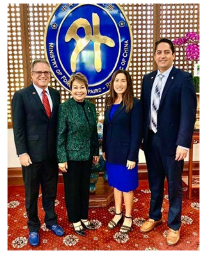
Sen. Kanuha and members of the Hawai'i State Senate visit Taiwan in October to foster relationship-building and discuss indigenous issues.