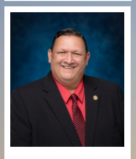
Senate District 20: 'Ewa Beach, Ocean Pointe, 'Ewa by Gentry, Iroquois Point, and portion of 'Ewa Villages