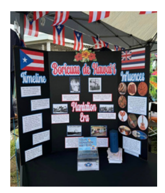
A display of showcasing the Hispanic influence in Hawai'i.

The Annual Hispanic Festival is celebrated during Hispanic Heritage Month, which runs from September 15 to October 15. This year, the 32nd Annual Hispanic Festival is centered on reflecting Hispanic Americans' service and contributions to the history of our Nation, and was held at the AMVETS West Oahu Veterans Center. This annual event celebrates the contributions and achievements of Latinos and Hispanics by recognizing various elements of their rich culture as demonstrated through their traditions of faith, family, food, and hard work. Mahalo to all the volunteers and vendors for your contribution to making this years' festival a success!