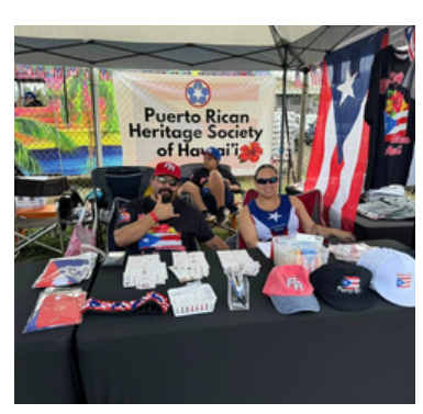
The Puerto Rican Heritage Society of Hawai'i had its own booth at the celebration.

The Annual Hispanic Festival is celebrated during Hispanic Heritage Month, which runs from September 15 to October 15. This year, the 32nd Annual Hispanic Festival is centered on reflecting Hispanic Americans' service and contributions to the history of our Nation, and was held at the AMVETS West Oahu Veterans Center. This annual event celebrates the contributions and achievements of Latinos and Hispanics by recognizing various elements of their rich culture as demonstrated through their traditions of faith, family, food, and hard work. Mahalo to all the volunteers and vendors for your contribution to making this years' festival a success!