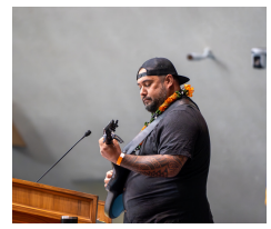
Mr. Tagavilla performing "Kona Grown" in the Senate Chamber.