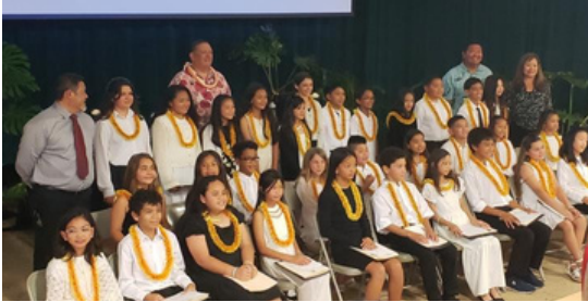
The ceremony was held at the Keone'ula Elementary School.

The Keone'ula Elementary School held an induction ceremony for thirty-two of our students into the National Elementary Honor Society (NEHS) - eleven students have continued on while twenty-one have been inducted into the honor society. To be invited into the honor society and at such a tender age is a great achievement and proves their academic excellence. Congratulations and mahalo for your commitment and hard work: