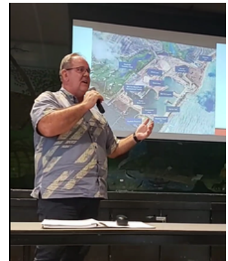
Haseko presented first on its updates relating to Wai Kai.