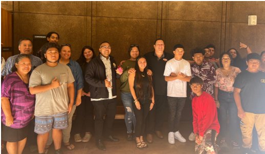
Nanakuli High and Intermediate School students and staff with legislators at the capitol.

Students from the Nanakuli High and Intermediate School visited the State Capitol. As we toured to a few places, I had the privilege to share my experiences and provide insight on the work we do as legislators and the staff handling community and constituency matters. Nanakuli High and Intermediate School has a motto that