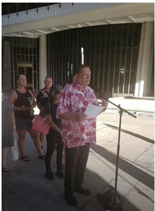
Senator Fevella holds a press conference at the Hawai'i State Capitol.

Following the letter to Governor Green, Lieutenant Governor Luke, and Attorney General Lopez, I held a press conference on September 5, speaking on what was mentioned in the letter- urging for a quicker moratorium on property sales in Lāhainā, placing a cap on attorney fees, and disbanding the Build Beyond Barriers Working Group to reshift it's focus on developing housing in Lāhainā.