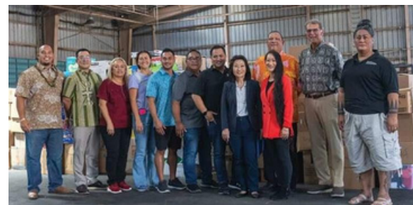
State government officials with members from OHA and CHNA pictured above in the Maui Relief Storage Facility.