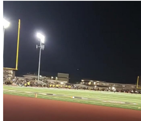
The Sabers football team playing against the Golden Eagles on home field.

https://www.campbellhighschoolathletics.org/