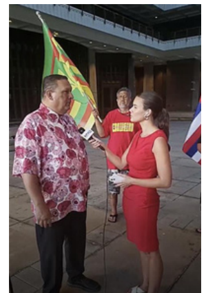
Sen. Fevella was interviewed by KITV news following the press conference.

KITV news wrote a piece on the press conference. You may click here to view the article.