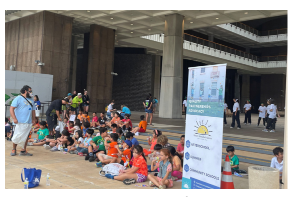
On October 19, 2022, schools from all over O'ahu came together to celebrate and support the need of having afterschool programs.

On Hawai'i Afterschool Alliance and afterschool programs joined in a nationwide series of celebrating and supporting afterschool programs. The importance of having these afterschool programs is essential as it helps our keiki develop academically and socially. The quality time used is not just for the benefit of our keiki, but also our parents, and communities.