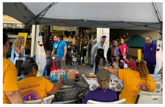
Members of the Ewa Beach Lion Club and HPD (not pictured) were passing out bags of treats to the keiki.

https://www.hawaiiafterschoolalliance.org/