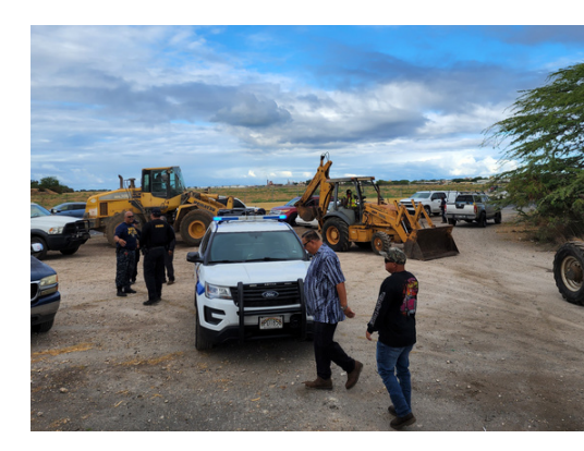
On August 23rd and 24th, we collected hundreds of vehicles, motorcycles, mopeds, generators, animals, and miscellaneous items.