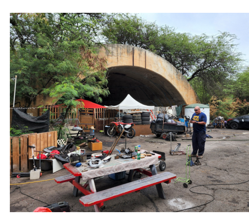
On August 25th, we did a final walk-through in the area that was cleared out. Again, a BIG MAHALO to the departments, agencies, and private companies for their hands-on work.