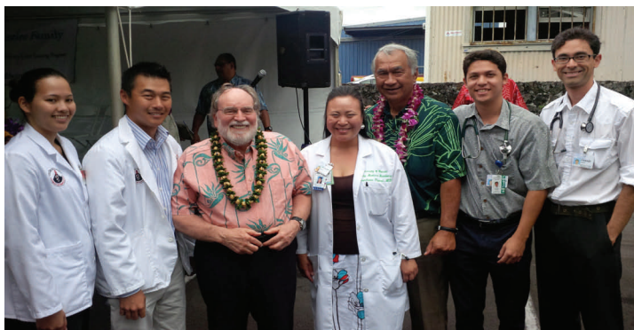
Gov. Abercrombie and Senator Kahele attended a check presentation ceremony on August 19th at the Hawai'i Island Family Health Center. UnitedHealthcare awarded a $250,000 grant to Hilo Medical Center.