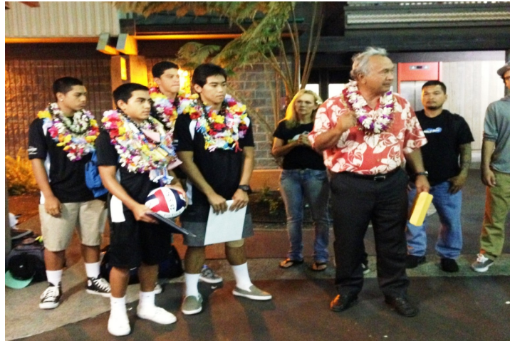
On July 5, 2013 Senator Kahele welcomed home the Southside Volleyball Club whose 14 Boys won the United States Association of Volleyball 2013 National Championships and the 16 Boys who finished 7th out of 68. Congratulations Gentleman!