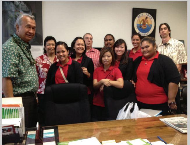
Members of UH Hilo's student body recently paid a visit to the State Capitol