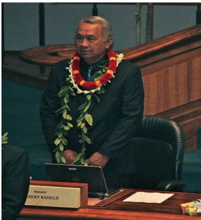
Senator Kahele at the start of the 2012 Legislative Session