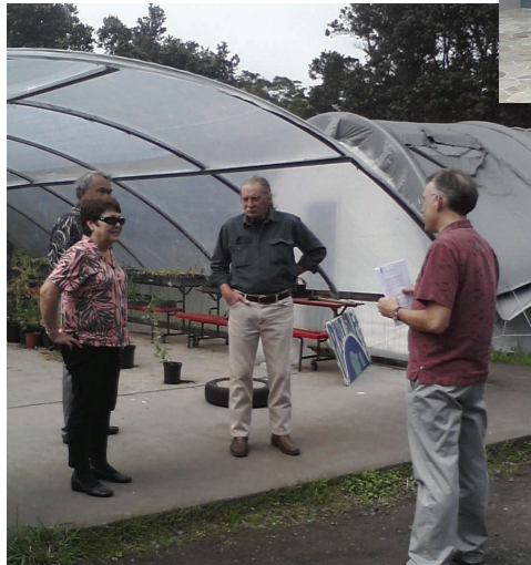
Visiting Volcano School of Arts & Sciences site