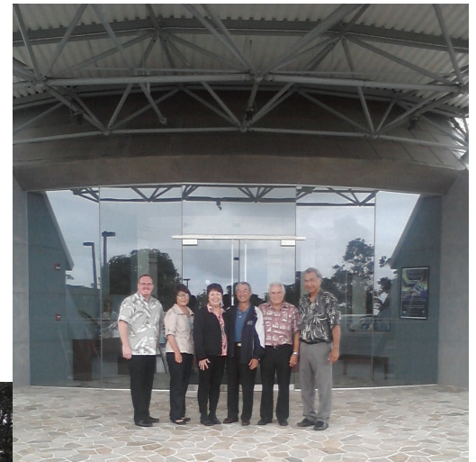
Gathered in front of `Imiloa Observatory

Sites visited included: University of Hawai'i Hilo, Hawai'i Community College, Pahoa Elementary School and Volcano School of Arts & Sciences.