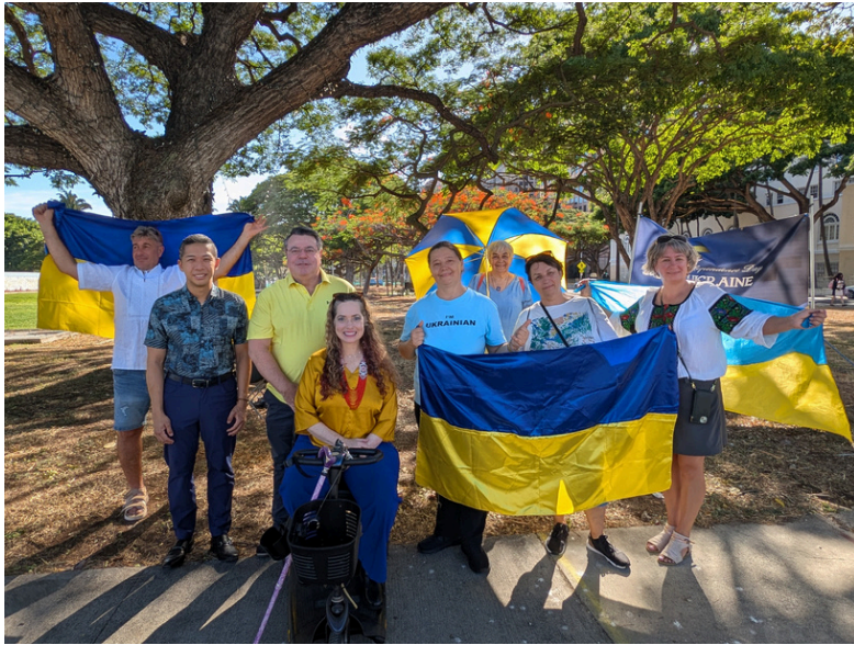
Rep Tam and Rep Amato with community members rallying in support of Ukraine.