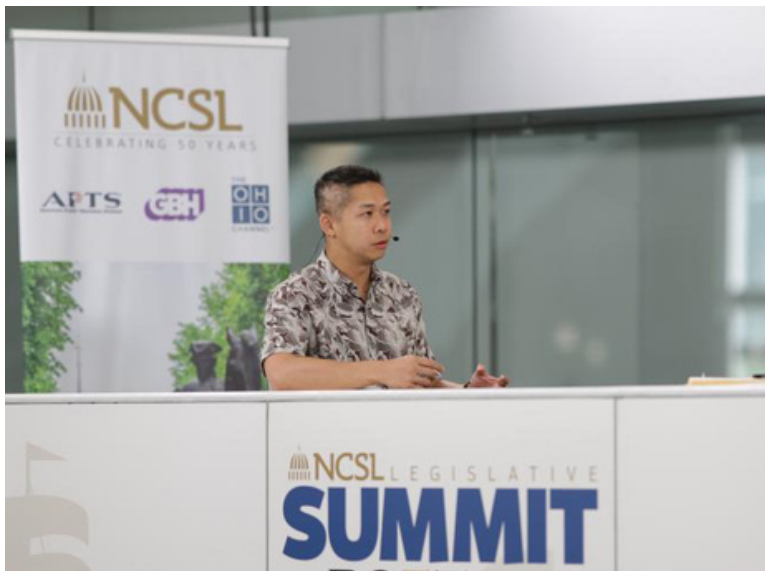
Rep Tam being interviewed at the National Conferences of States Annual Summit in Boston.