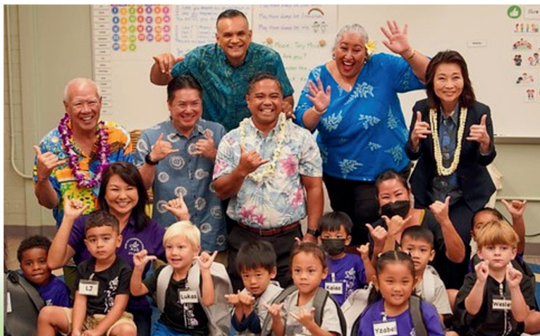
Lt. Governor Sylvia Luke joined other guests at Pearl City Elementary to celebrate the opening of a new pre-kindergarten classroom on September 27.