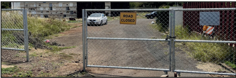
A new security gate has been installed at Sunset Memorial Park Cemetery .

Sunset Memorial Park Cemetery has received a State grant of $150,000 and a City grant of $125,000 for improvements to security and grounds. Recently volunteers led by Larry Veray installed a security access gate to discourage trespassers and illegal dumping - the first of many changes coming to the Cemetery.