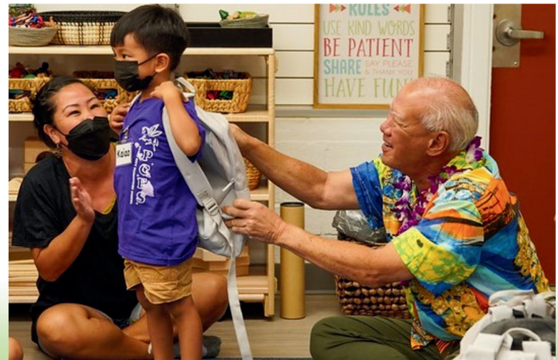
Pre-kindergarteners at Pearl City Elementary were presented with free backpacks filled with school supplies donated by Lt. Governor Luke's office.