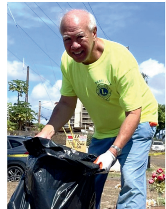
Gregg joined more than one hundred volunteers helping clean up Sunset Memorial Park Cemetery on the Memorial Day weekend.