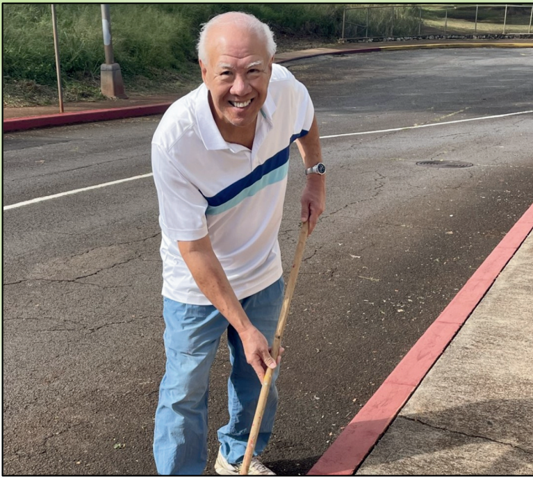
Gregg helped paint curbing at Pearl City Highlands Elementary School at its community work day on April 12.