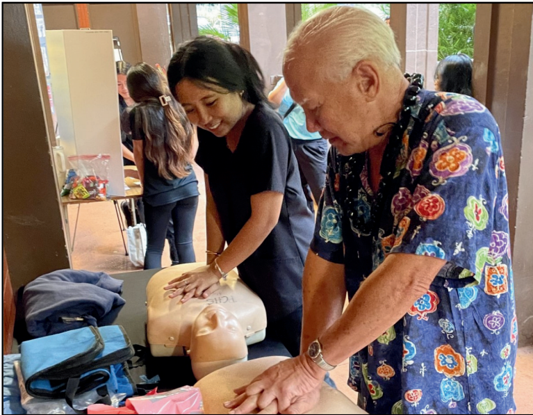
Pearl City High School's annual Chargerpalooza student showcase on April 3rd included instruction on delivering cardiopulmonary resuscitation.