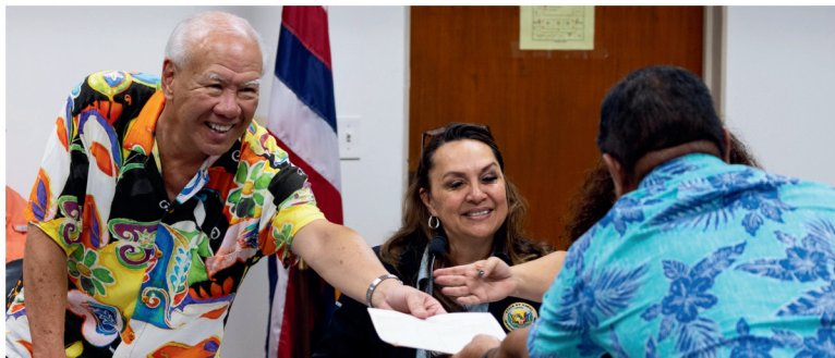
A House-Senate conference committee completed negotiations on a health bill with the exchange of copies between Gregg and Sen. Henry Aquino.

Foreign Medical Graduates. Increases the supply of physicians by expanding the pathway for foreign medical school graduates to be licensed as physicians after passage of certain examinations and two years' post-graduate medical training. HB1379 (Act 174)