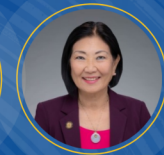
SENATOR SHARON Y. MORIWAKI