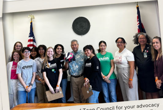
Mahalo Planned Parenthood Teen Council for your advocacy and supporting Rep. Saiki's resolution requesting the DOE to standardize sex education curriculum in Hawaii.