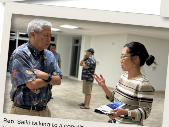
Rep. Saiki talking to a constituent during the town hall held at 801 South St.