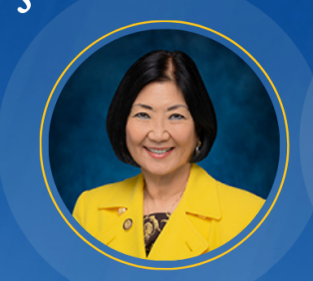
SENATOR SHARON Y. MORIWAKI