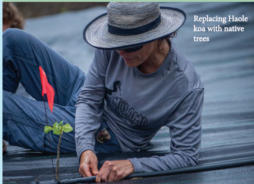
Replacing Haole koa with native trees

As a member of the Agriculture Committee, I heard and supported many initiatives. Key projects funded include: food hubs, food safety certification, soil improvements, cover crops, farmer apprentice mentoring, emergency loans, purchase of irrigation infrastructure serving agricultural parks, purchase of a building for a DOE agricultural training center, control of agricultural pests such as axis deer on Maui, coffee leaf rust and little fire ants. Changes were made in regulations in order to promote: kalo farming, aquaculture, hemp farming, development of agricultural infrastructure, control of feral pigs, and local agricultural purchases for public schools and prisons.