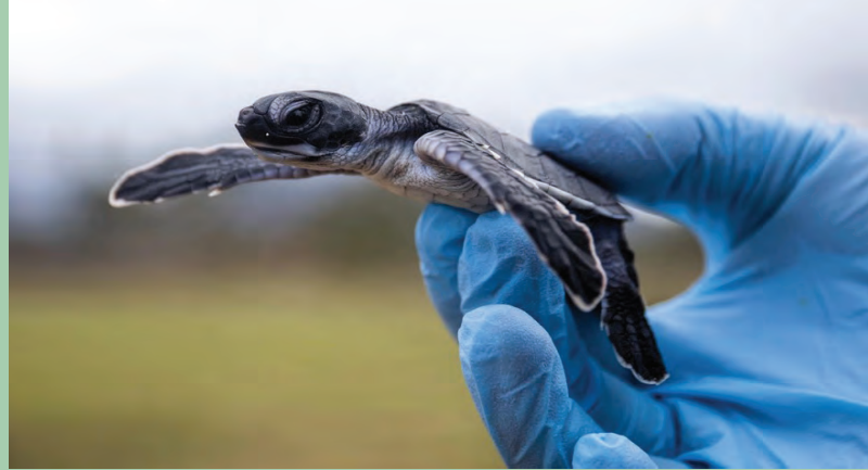
Several Honu nested at Marine Corps Base Hawai'i and Bellows

sequestering carbon in trees and soil, and setting goals for decarbonization, including for ground and inter-island transportation, and commissioning the groundwork to get us there.