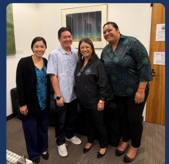
On 3/11/26, Adult Friends for Youth (AFY) advocates visited Representative Chun to discuss their Grant-in-Aid application.