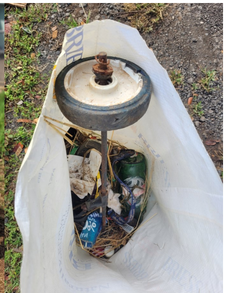
Cleanup day along the Pearl Harbor Bike Path in honor of Earth Day 2023. Representative Chun alongside 300 other volunteers went to work along the full stretch of the 10 mile trail collecting 4.79 tons of trash, 22 tires and 8.24 additional tons of metal