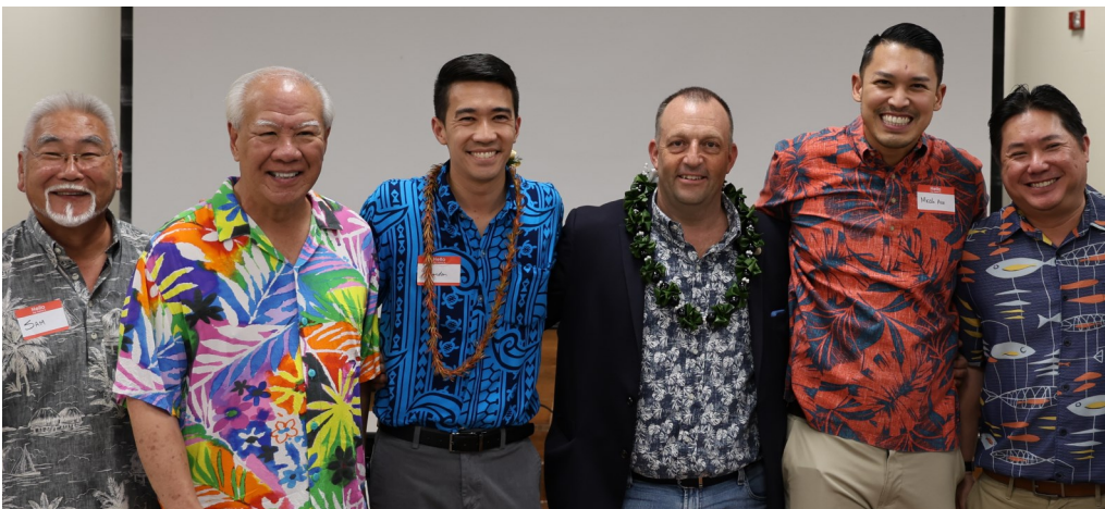
Pearl City and Aiea Legislators hosted the Governor's first Townhall event at Pearl Ridge Elementary School. (Left to right) Rep. Kong, Rep. Takayama, Senator Elefante, Governor Green, Rep. Aiu, and Rep. Chun came together to highlight some of the accomplishments of the 2023 legislative session and take questions from the community