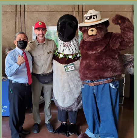
Agriculture day at the State Capitol