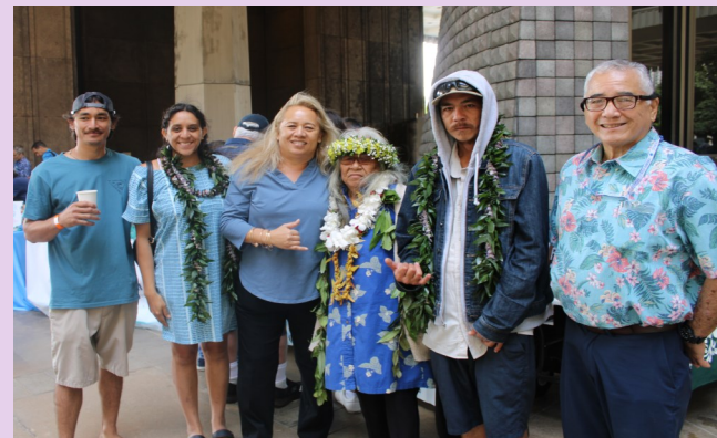
The Kipahulu Ohana at Ocean Awareness Day at the State Capitol! Kipahulu after many years of community collaboration has gained the Community Based Subsistence Fishing Area designation through DLNR's Division of Aquatic Resources.