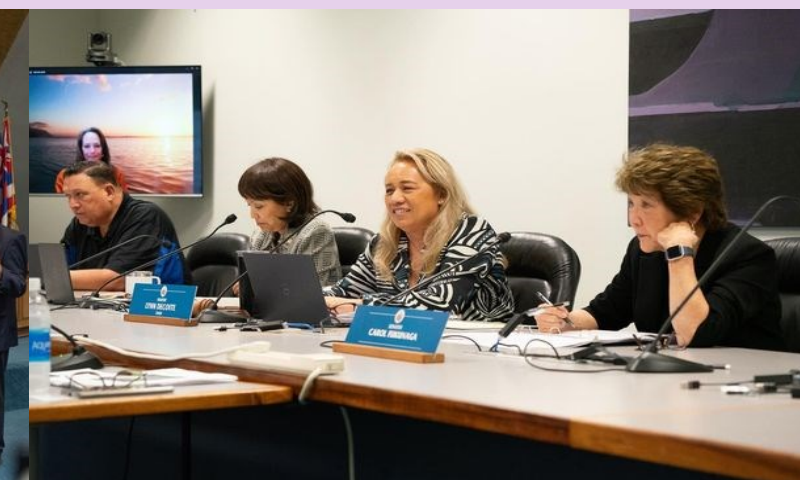
The Energy, Economic Development, and Tourism Committee at an Informational Briefing on the Film Industry in Hawai'i