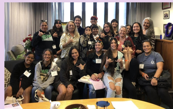
Students and Teachers from Moloka'i visited my office as they were attending the "We Grow Hawaii-A Youth Food Summit" at the State Capitol.