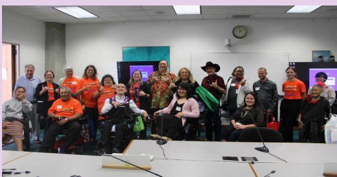
State Council on Developmental Disabilities Advocacy Day! It was my honor to host a mock hearing so the Self-Advocates could learn to participate in the Legislative process!