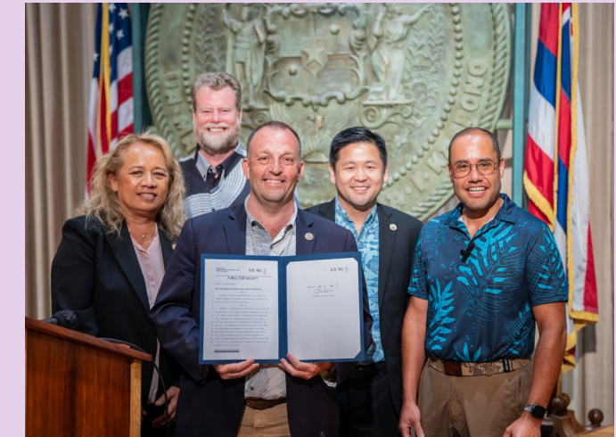
Bill Signing for SB 582 (RELATING TO STATE BUDGET) on May 2, 2024. SB 582 Appropriates funds to support the State's response to the August 2023 wildfires that affected the County of Maui.